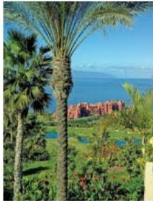
Not only the course, but the resort as a whole was awarded