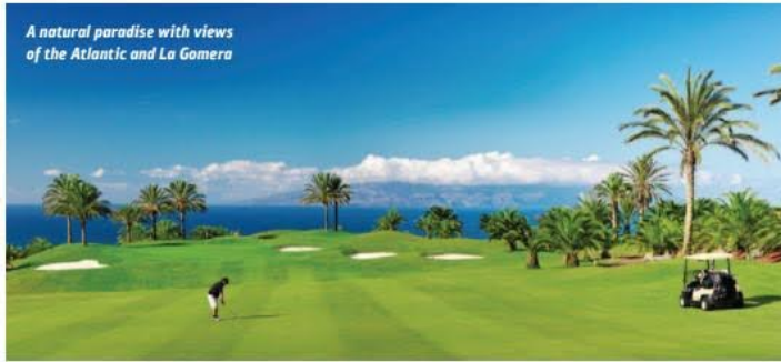
A natural paradise with views of the Atlantic and La Gomera

The Abama Golf Resort, consisting of a golf course and the Ritz-Carlton Abama Hotel, was recently voted among the top three of its kind in Spain by the renowned specialist website for golf holidays www.the-leadingcourses.com .