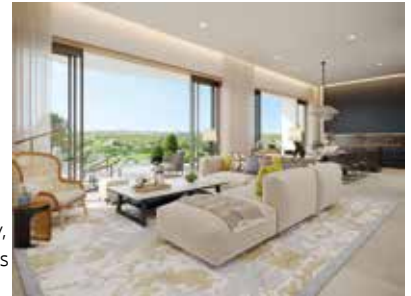
Green light Penthouse apartment at Limassol Greens. Below: the Clubhouse Terrace. Left, from top: Sandy Lane Estate driveway; the Country Club course

The villas, townhouses and apartments are light and airy, with floor-to-ceiling windows and sun terraces. But the masterpiece here is the big-hitting 18-hole green, designed by golf architect, Cabell B Robinson, whose courses frequently appear on the world's best lists. Notable characteristics include Bermuda grass rough that will swallow a ball whole, wide fairways, surging greens and tricky pot bunkers, while holes five and six are set in a natural wetland. ◆ Two-bed apartments start from €500,000. Two-bedroom 180sqm townhouses from €1.1m. limassolgreens.com