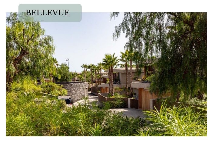
Designer homes, impeccable detail

Since Abama's properties were first released in 2011, there has been tremendous interest from buyers all over the globe. Though these homes have sold out, we are proud to count them among our exclusive Abama residential communities.