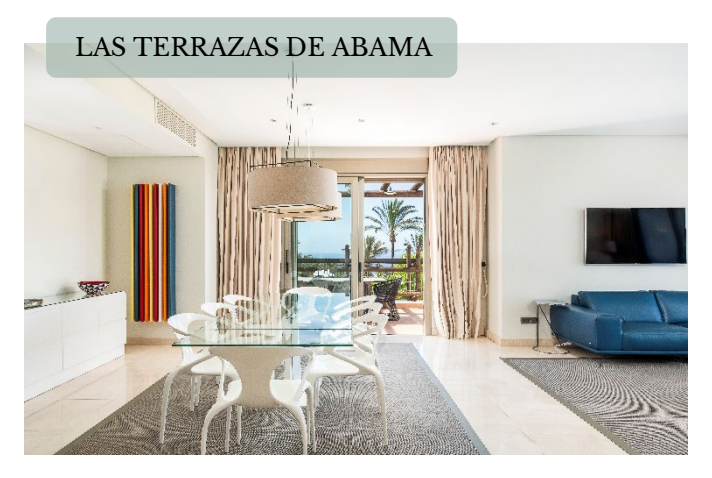
Turn-key modern elegance

Private outdoor infinity pools offer views to the Atlantic, and the outdoor landscaping, private parking, and mini-pool on first floor are additional exclusive features. These properties won the award in 2018 for "Best New-Build Homes of the Decade" from the Association of Architects of Tenerife, El Hierro and La Gomera.